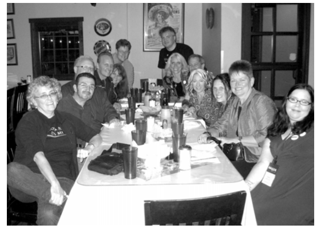
Dallas bi community members & allies shared a delicious Mexican meal with visiting bi activists in town for the Out & Equal Workplace Summit

Representatives from the Bisexual Resource Center, the American Institute of Bisexuality, Pride at Work Canada, and several independent consultants working in diversity areas were involved with the planning and facilitation of the workshops. Topics ranged from how to be allies to bi folks in a workplace setting, bi identity, research on bisexuality, and a panel of bi experts discussing community issues from a variety of perspectives. Always